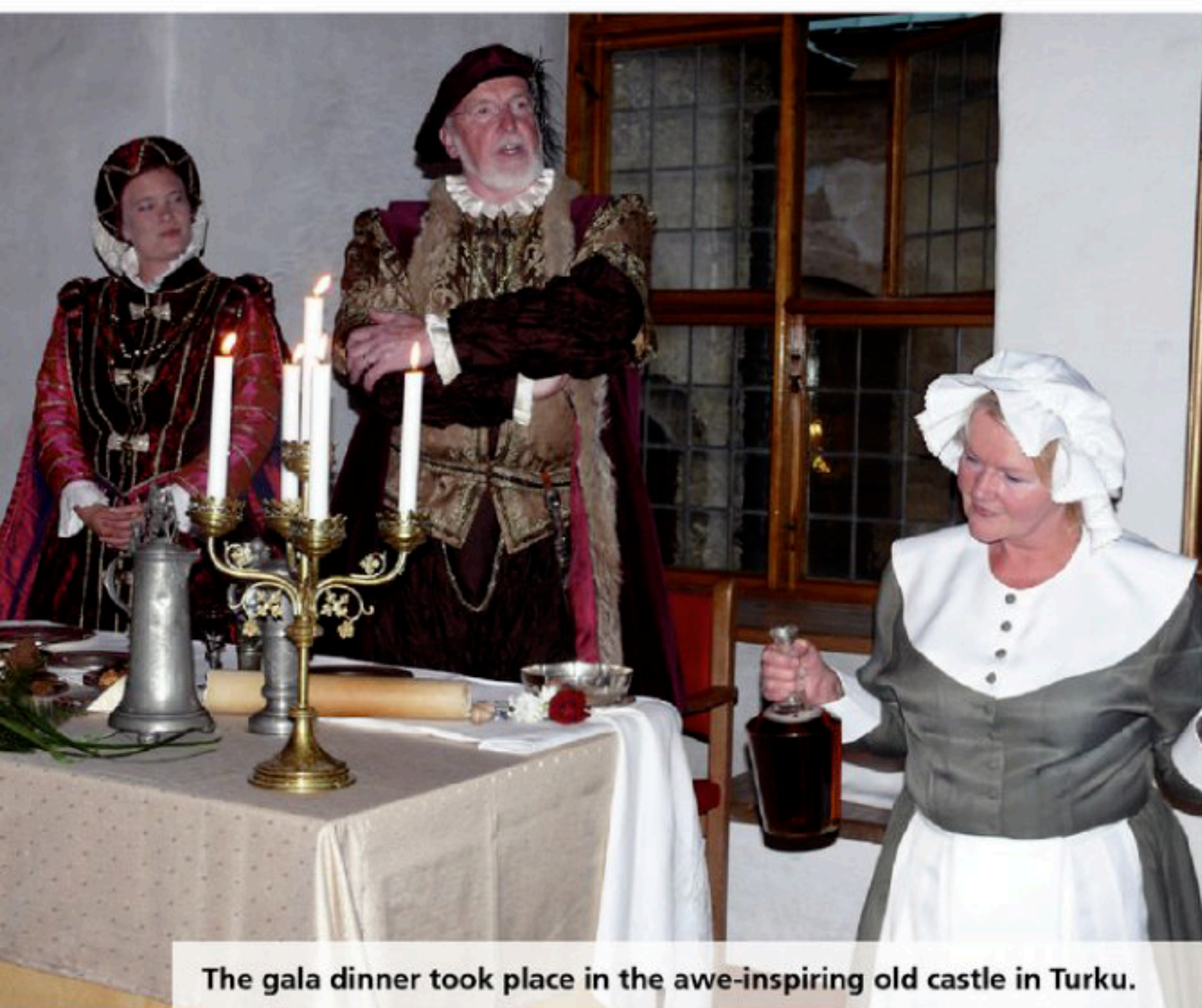
The gala dinner took place in the awe-inspiring old castle in Turku.